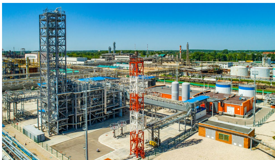
The plant of our joint venture DME Aerosol for the production of high-purity aerosol-grade dimethyl ether (DME) in the Tula region of Russia has driven successful business development since its start-up at the end of 2018.

cantly compared to the preceding quarters as a result of freight car tariffs having once again risen. In addition, ZAO PCC Rail benefited from improvements in the Russian ruble exchange rate, moving its pre-tax result at the end of September into marginally positive territory supported by positive currency translation effects. Nevertheless, its sales and earnings remained below 2021 expectations.