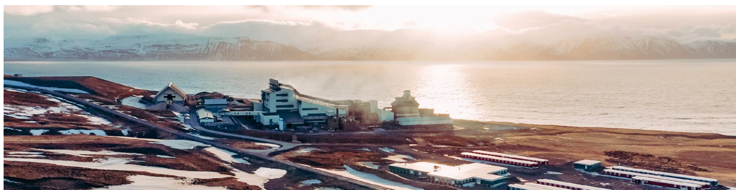
The silicon metal production facility of our Group subsidiary PCC BakkiSilicon hf. in Iceland operates solely on the basis of renewable energy sources, such as geothermal energy, making it particularly climate-friendly.

numbers surpassing the already exceptionally good figures of the prior-year period.