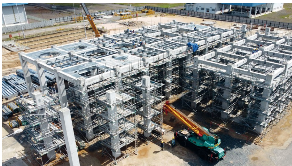
In Malaysia, we are building a production plant for oxyalkylates in a joint venture with PETRONAS Chemicals Group Berhad. The construction work continues to progress to schedule. This photo shows the site as it looked in March 2022.

As expected, the Holding & Projects segment recorded a loss in the first quarter of 2022. The affiliates remaining in this segment alongside the holding company PCC SE and the intermediate holding company PCC Chemicals GmbH are, for the most part, project companies and entities that generally operate at a deficit due to the fact that their own revenue-generating operations are small or non-existent. PCC SE